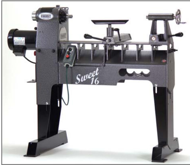
Above: Sweet 16 as a normal 16" lathe. Standard Bed Shown, Short & Long Beds also available

Converts to any of these configurations in under a minute !