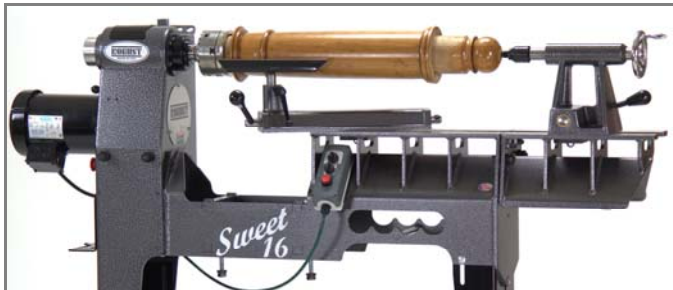
Positioned the gap at the end of the bed to turn long spindles. Note banjo bridges gap.