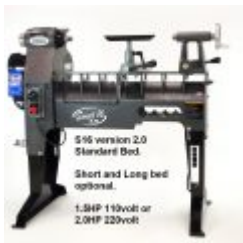
S16 v2 800

The main feature of the S16 is its removable bed section. Removing the section creates a gap to let you turn a bowl or platter up to 32". Moving the section to the end of the lathe increases spindle turning capacity by 14". The Sweet 16 video demonstrates these features in action.