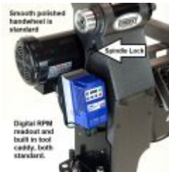
S16 v2 Headstock 800