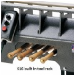
S16 SS 5