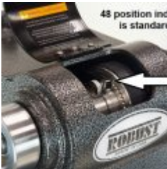
S16 v2.0 Indexing 800