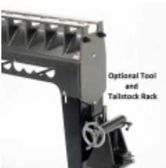
S16 SS 8