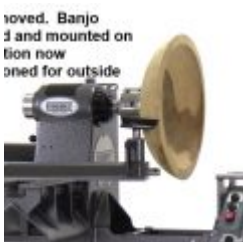
S16 Gap 2 Annotated