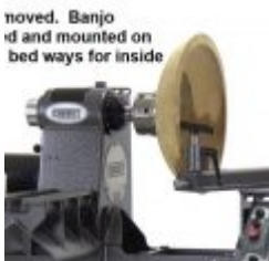
S16 Gap 1 Annotated