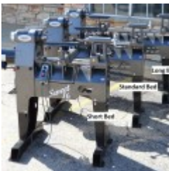
S16 SS 10