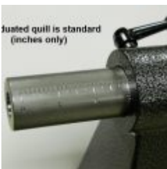
Graduated Quill Annotated