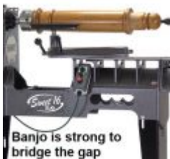
S16 v2 Extended – Annotated